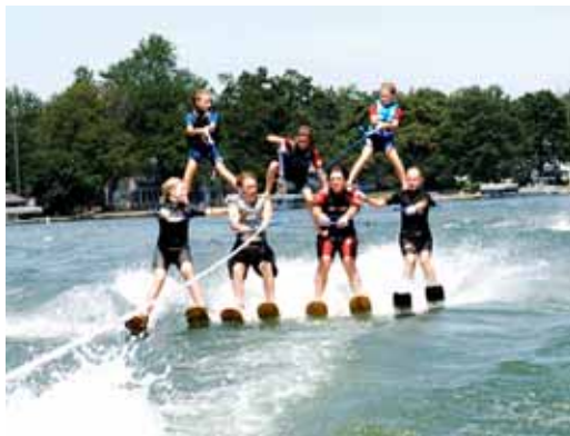
There are seven skiers in

is just $50. Payment can be made on arrival but please email "jlg@home@kconline.com" of your intention to come. Registration forms are available at http://clyc.sailrite.com (select DOCS and then Sailing Camp). These forms, too, can be filled out on arrival.