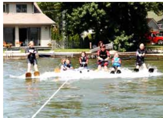
Launching seven is no mean