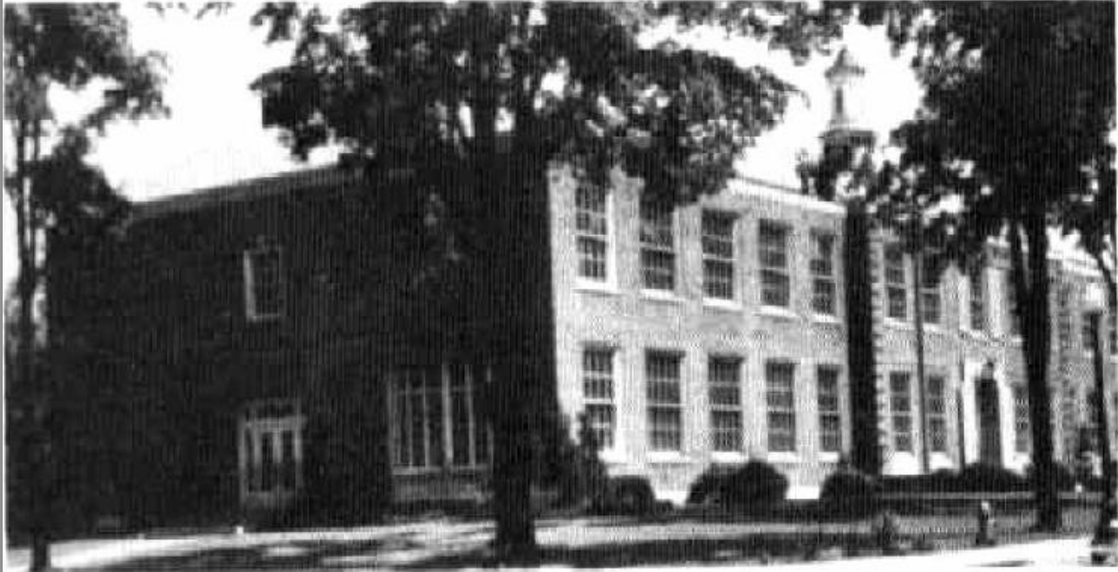
Carl Bailey School built on the Manning Street