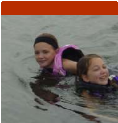
We do a good deal of swimming at Sailing Camp!